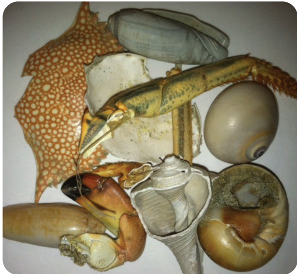
Sample NOT under magnification. Items found in feces: Marine Organisms