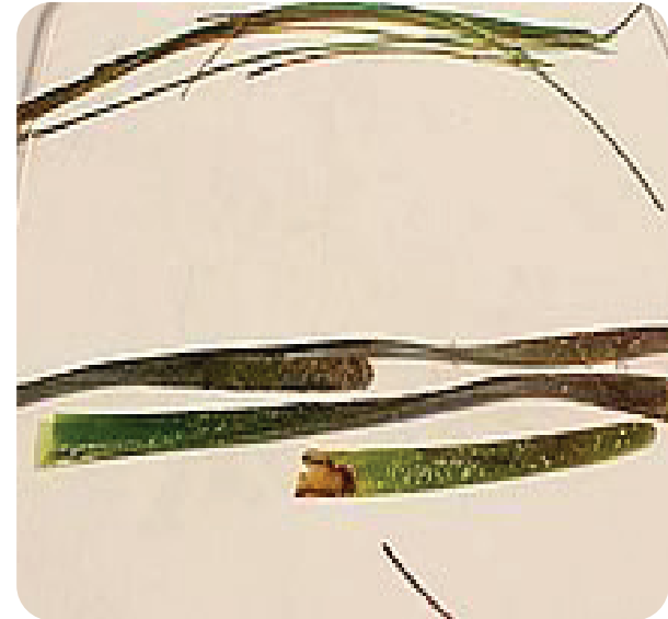
Sample NOT under magnification. Items found in feces: Marine Vegetation